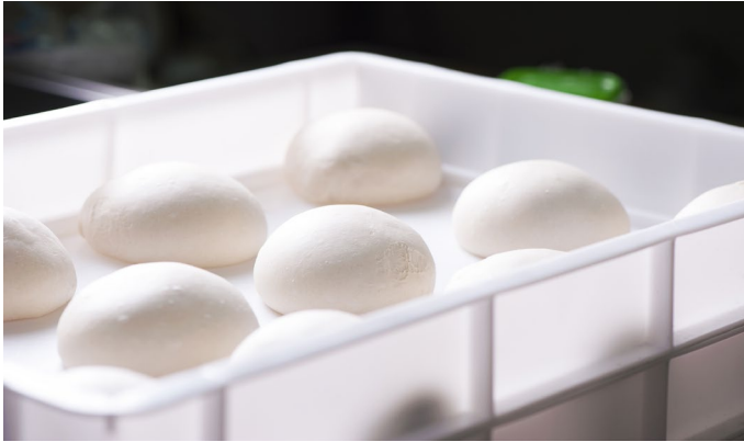
FRODOU01 Sourdough Pizza Doughball (Frozen) 70 x 220g / Case Was £58.09 Now £52.95