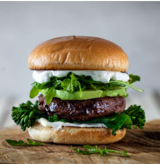
FROBRE21 Gourmet Sliced Brioche Style Buns (Vegan) 8 x 6 x 90g Was £21.55 Now £18.90