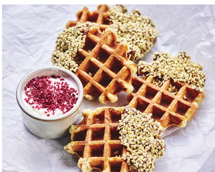
FROBRE35 Belgian Plain Waffles 20 x 90g Was £12.78 Now £11.55