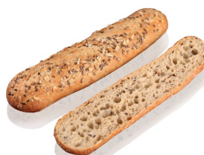
FROBRE10 Half Baguette Multicereal (Heritage stone baked) (25cm) 70 x 130g Was £52.08 Now £45.55