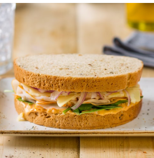
FROBRE25 Medium Malted Sliced Bloomer (17 slices) 6 x 800g Was £15.62 Now £13.65