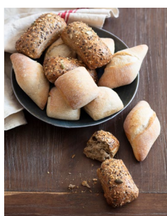
FROBRE08 Mini Rustic Roll Selection (part baked) 105 x 40g Was £35.35 Now £30.95