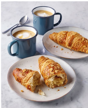
FROBRE15 Almond Croissant (ready to bake) 48 x 90g Was £38.20 Now £33.45