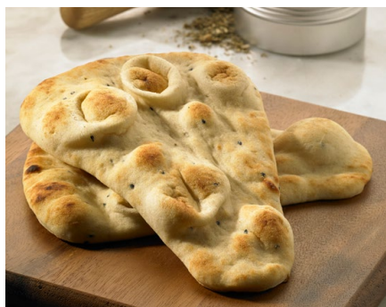
FROBRE32 Mini Tear Drop Naan 24 x 75g Was £9.13 Now £8.25