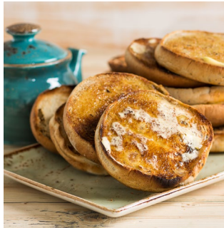
FROBRE18 Spiced Fruit Teacakes 8 x 6 x 95g Was £18.59 Now £16.30