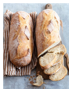
FROBRE11 Sourdough Bloomer (fully baked) 12 x 650g Was £36.20 Now £31.65