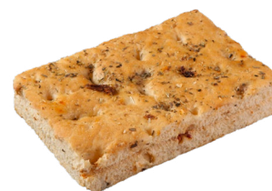
FROBRE07 Tomato & Oregano Focaccia Pre-sliced (thaw & serve) 48 x 90g Was £39.70 Now £34.75