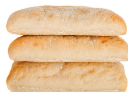
FROBRE04 Plain Panini (part baked) 30 x 135g Was £10.75 Now £9.45