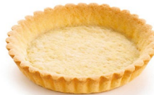
PIDY89546072 Sweet Tart Case 11cm | 72 case Was £41.64 Now £35.55