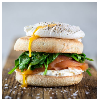
FROBRE27 English Muffins 75g 8 x 6 x 75g Was £14.35 Now £12.55