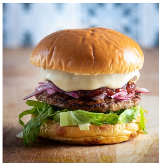
FROBRE26 Sliced Brioche Bun 6 x 8 x 75g Was £16.82 Now £14.75