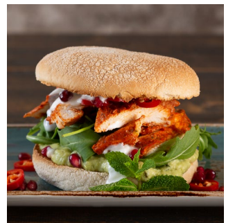
FROBRE28 Gourmet Sliced Sourdough Bun 6 x 9 x 90g Was £22.67 Now £19.85