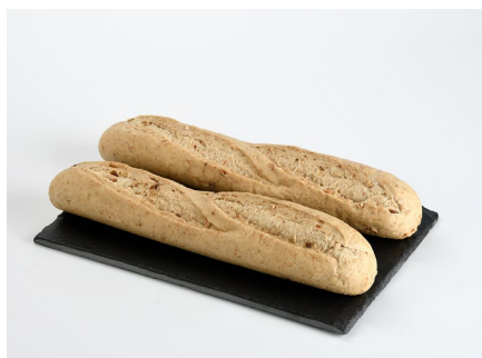
FROBRE05 Small malted Baguette (part baked) 30 x 135g Was £11.69 Now £10.25