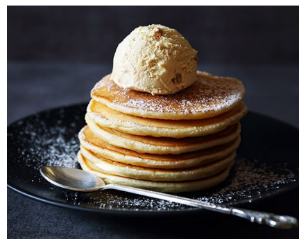
FROBRE34 American Style Pancakes 120 x 40g Was £30.92 Now £27.95