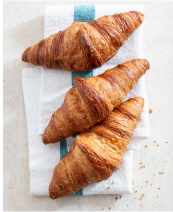
FROBRE13 Croissant (ready to bake) 100 x 60g Was £28.81 Now £25.25