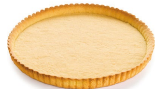
PIDY91046010 Sweet Tart Case 28cm | 10 case Was £48.55 Now £40.90