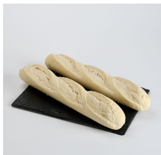
FROBRE01 Small White Baguette (part baked) 30 x 135g Was £9.17 Now £8.05