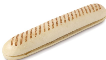
FROBRE06 Bar-Marked & Pre-Sliced Panini (27cm) (part baked) 70 x 110g Was £51.81 Now £45.30