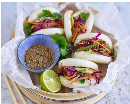
FROBRE30 Bao (Hirata) Buns 2 x 30 x 50g Was £35.32 Now £31.90