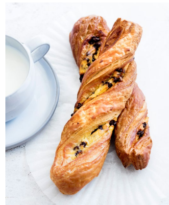
FROBRE16 Chocolate Twist (ready to bake) 60 x 100g Was £50.01 Now £43.75