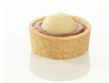
PIDY30380096 Trendy Round Sweet Butter 7cm –96 case Was £89.90 Now £75.90