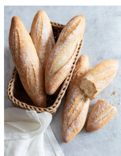
FROBRE09 Rustic Half Baguette, Sourdough (27cm) (part baked) 50 x 120g Was £31.18 Now £27.25