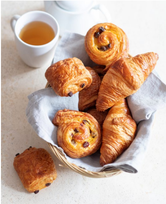
FROBRE12 Mini Pastry Selection (ready to bake) 130 x 25-30g Was £30.96 Now £27.15