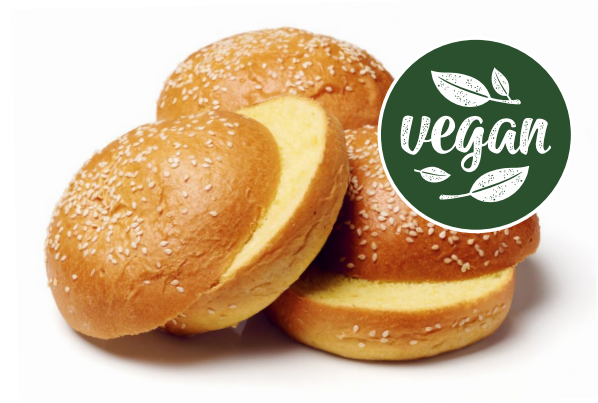
FROBUN07 Plant based Glazed, sliced & seeded Brioche Buns (Frozen) 48 x 90g / Case Was £48.35 Now £42.65