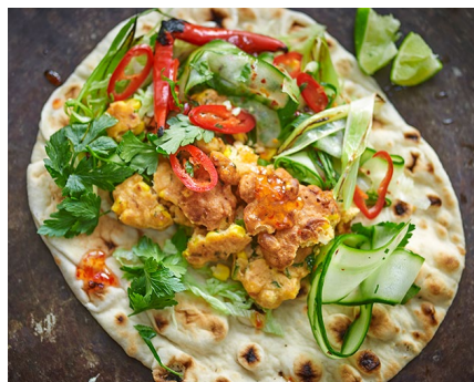
FROBRE31 Oval Sourdough Wrap 24 x 120g Was £18.80 Now £16.95