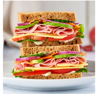
FROBRE20 Brown Sliced Bread (Genius) Gluten Free 6 x 430g Was £33.14 Now £28.95