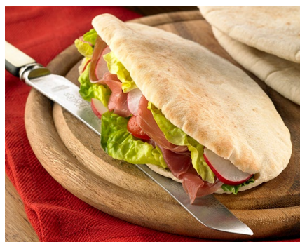
FROBRE36 White Pitta Bread 72 x 60g Was £19.50 Now £17.60