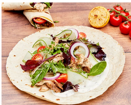
FROBRE33 Gluten Free Wraps 10.5" 72 x 55g Was £52.93 Now £47.80