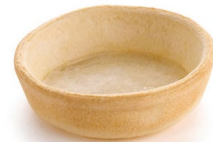
PIDY74901027 Neutral Round Quiche Case (gluten free) 8.5cm –27 case Was £41.64 Now £34.95