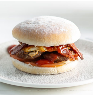
FROBRE17 Floured Baps 6 x 8 x 90g Was £11.44 Now £9.90

An Innovating, wholesale bakery for nearly 40 years. With a portfolio of products that suits all caterers and menus. The bakery portfolio includes original products plus gourmet brioche, traditional sliced bread, bloomer breads and vegan and gluten-free options.