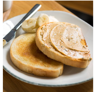
FROBRE24 Medium White Sliced Bloomer (17 slices) 6 x 800g Was £15.18 Now £13.30