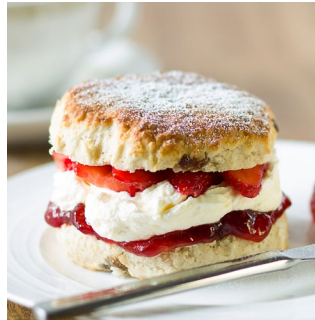
FROBRE23 Large Sultana Scone 12 x 5 x 109g Was £28.24 Now £24.75