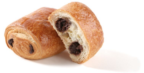
FROBRE14 Pain au Chocolat (ready to bake) 80 x 75g Was £28.68 Now £25.15