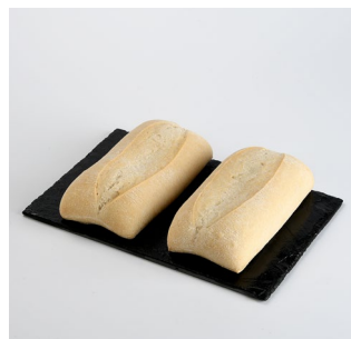
FROBRE03 Ciabatta (part baked) 40 x 120g Was £18.78 Now £16.45