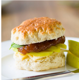
FROBRE22 Plain Scone 6 x 10 x 65g Was £19.66 Now £17.25