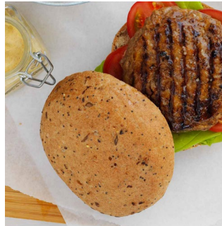
FROBRE19 Mixed Seeded Rolls (Genius) Gluten Free 25 x 68g Was £22.10 Now £19.35