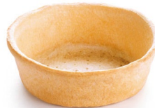
PIDY76000042 Neutral Round Quiche Case 11cm –42 case Was £48.19 Now £39.95