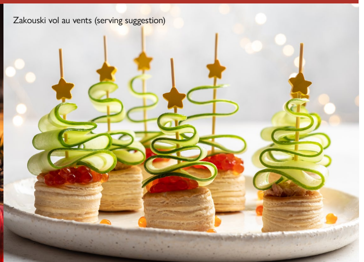
Zakuski vol au vents (serving suggestion)