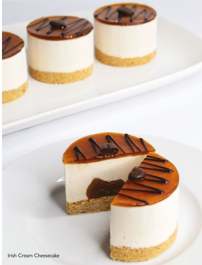
Irish Cream Cheesecake