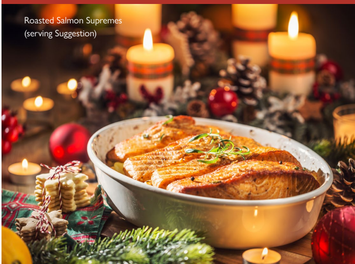
Roasted Salmon Supremes (serving suggestion)

For pre-orders and prices please contact your Account Managers or the Sales Office Team on 01264 321050