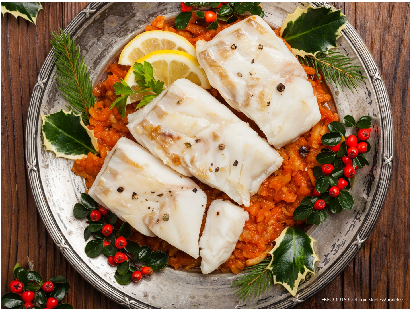
FFRCOD15 Cod Loin skinless/boneless