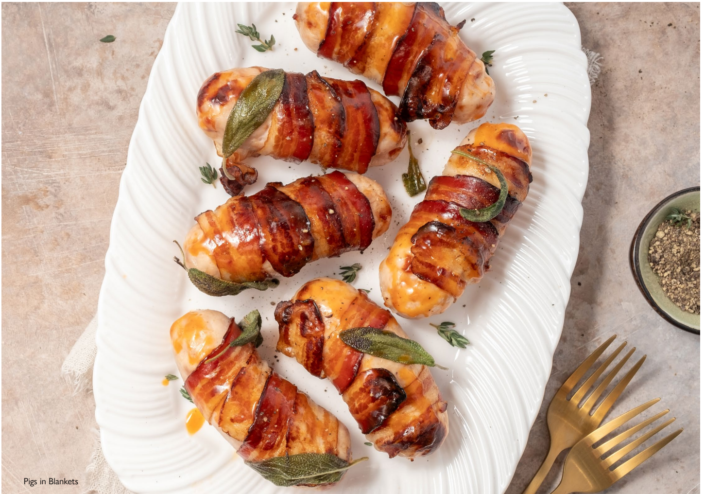
Pigs in Blankets