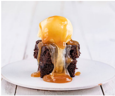
WWTOP02 Salted Caramel Dessert Topping (OTT) 6 x 500g £16.85