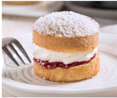
WWTOP03 Strawberry Dessert Topping (OTT) 6 x 500g £14.85