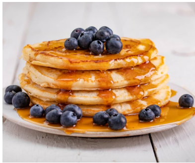
WWTOP05 Maple Syrup Dessert Topping (OTT) 6 x 500g £16.65