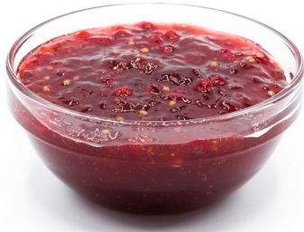
WWSAU46 Cranberry Sauce (2kg) £8.75