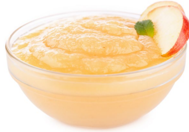
WWSAU47 Apple Sauce (2kg) £8.75