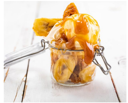
WWTOP04 Toffee Dessert Topping (OTT) 6 x 500g £14.95