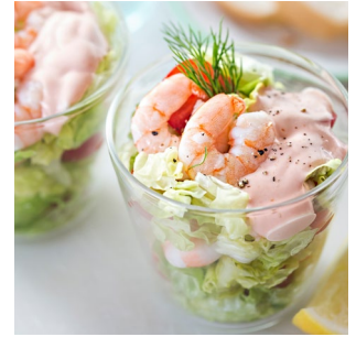
FRFPRA08 (Serving suggestion)