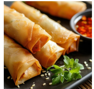
FRMSPR05 (Serving suggestion)