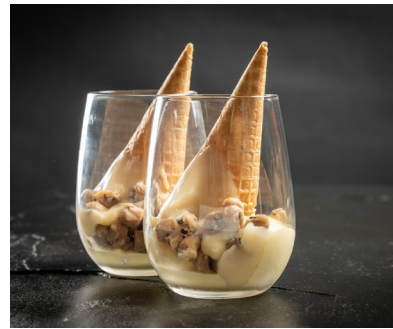
WWTOP06 White Chocolate Dessert Topping (OTT) 6 x 500g £25.95

Please click on our web site to download our brochure and see the full range that Cooper Foods offer